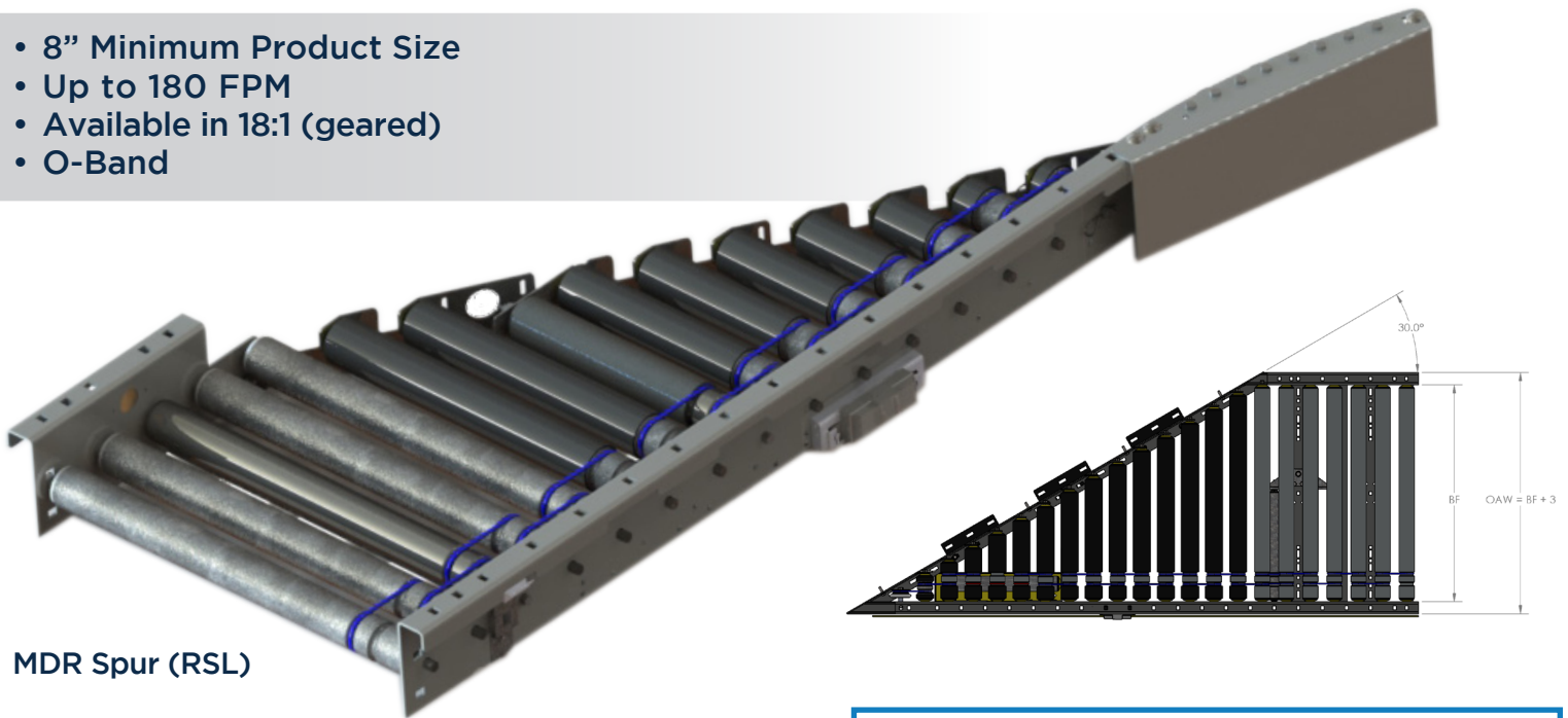
MDR Spur (RSL)