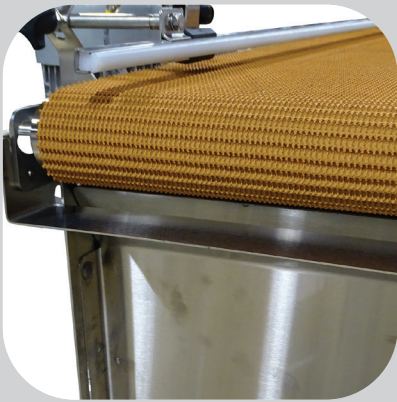
Tan Rough Top