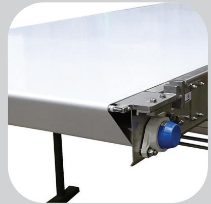
White Polyurethane Food Grade